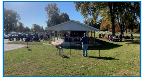
WEB bake sale. Confirmands filled hygiene kits for CWS. Outdoor worship service.