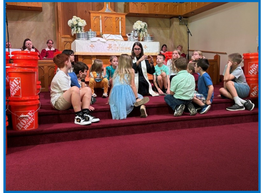
Disaster relief supply buckets filled for Church World Service.