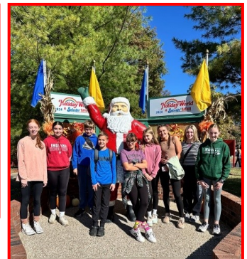
Youth (and adult leaders) at Holiday World