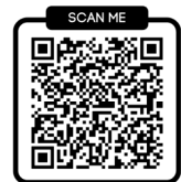
Koch Scholarship Form

Please return the completed application, including a certified copy of your academic transcript, to the Memorial Committee mailbox (by the church elevator), no later than May 31, 2025.