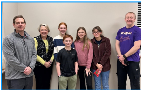
1st Place - Swiftly Winning